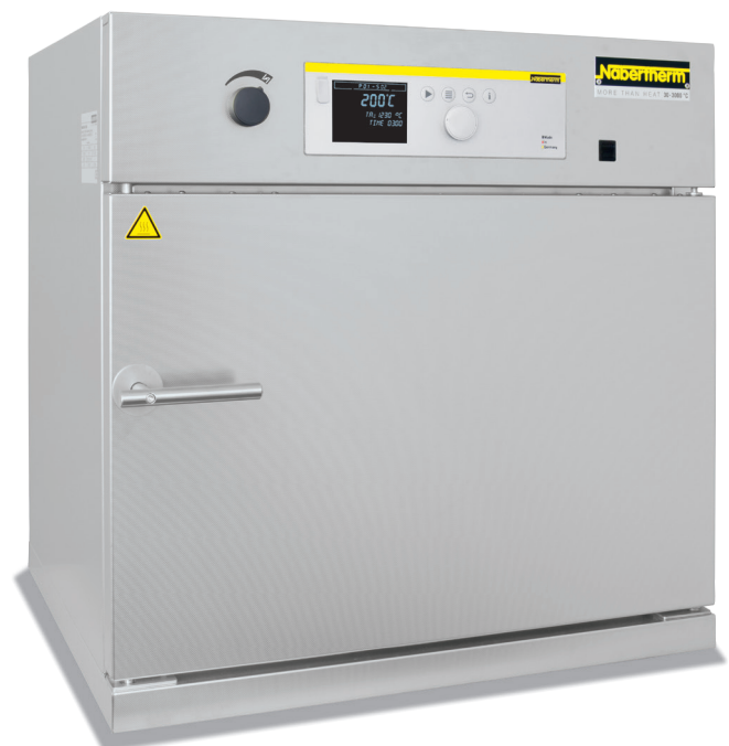
Oven TR 30

Nabertherm uses only insulation materials that are not classified as carcinogenic according to TRGS 905, Class 1 or 2 in the production of its furnaces. This change in the range was already implemented two years ago. Consequently, Nabertherm remains a pioneer in the area of furnace production technology.