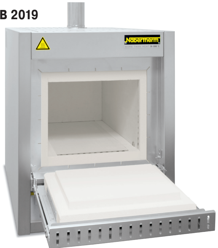
Ashing furnace L 40/11 BO

Nabertherm with 500 employees worldwide have been developing and producing industrial furnaces for many different applications for 70 years. As a manufacturer, Nabertherm offers a wide and deep range of furnaces worldwide. 150,000 satisfied customers in more than 100 countries offer proof of our commitment to excellent design, quality and cost efficiency. Short delivery times are ensured due to our complete inhouse production and our wide variety of standard furnaces.